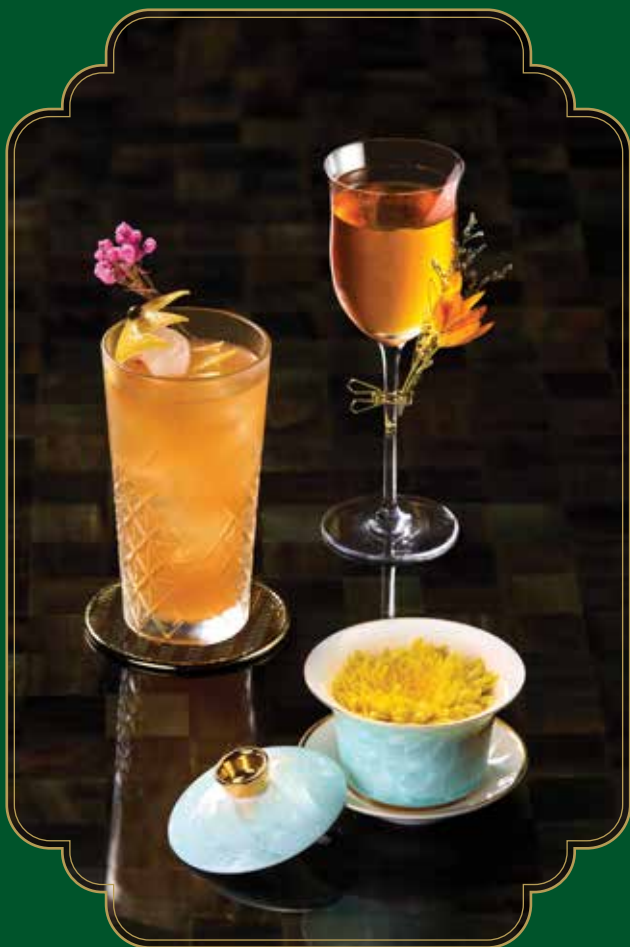
花樣年華·桃裡看花·清空幽蘭 - 特調冷萃茶 The Golden Era • Flower Blossom • Mystical Magnolia - Special Cold Brew Tea