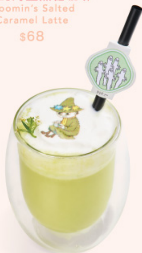
史力奇的翠綠拿鐵 Snufkin's Green Latte $68