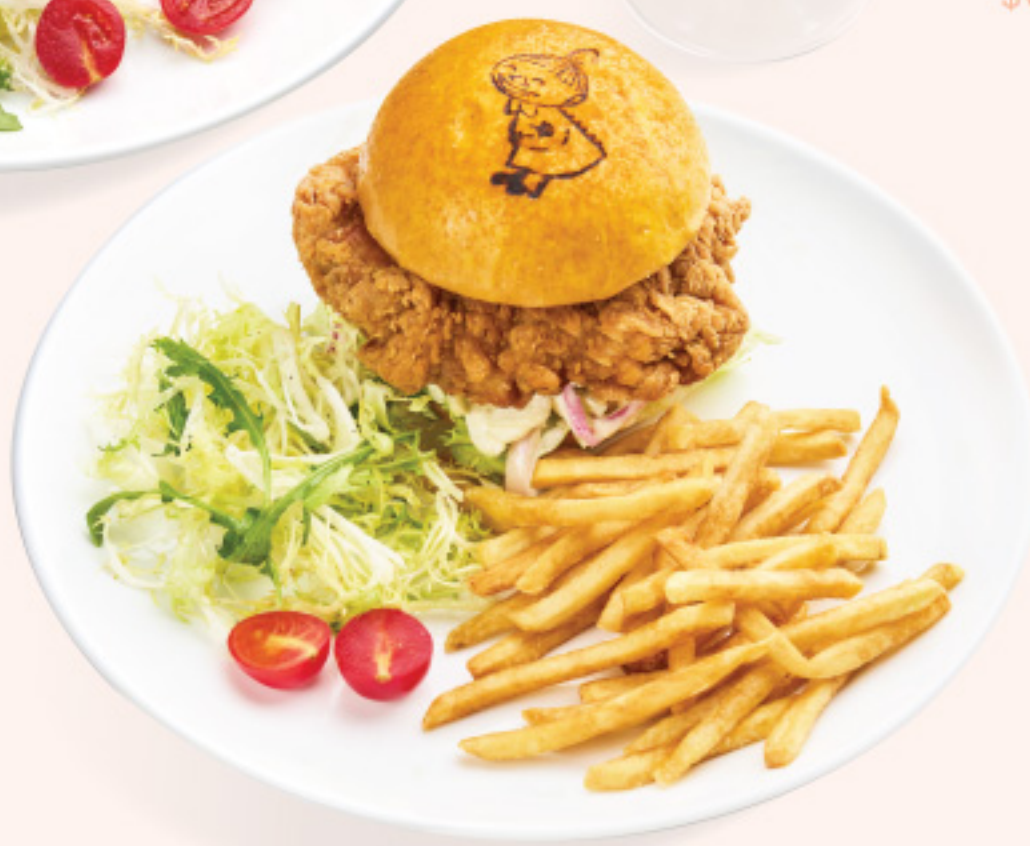
小美的炸雞漢堡 Little My's Fried Chicken Burger $98