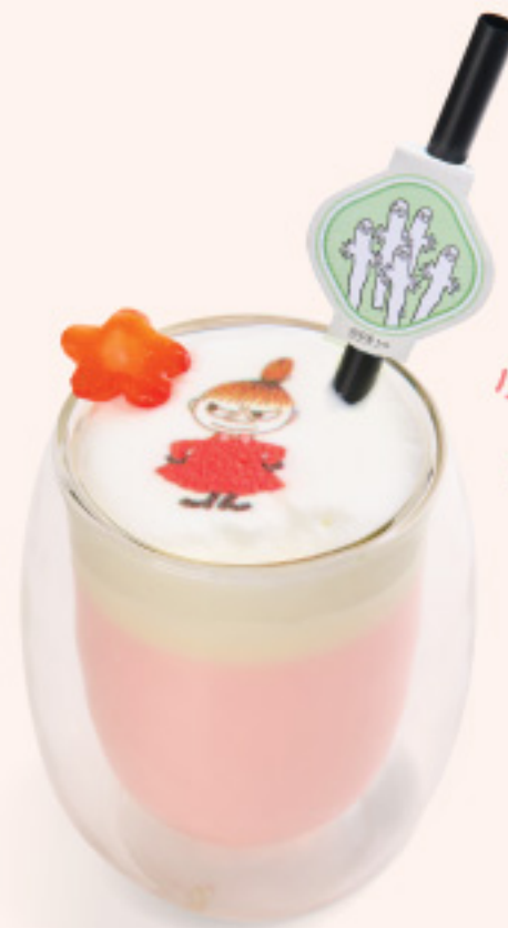
小美的草莓牛奶 Little My's Strawberry Milk $68