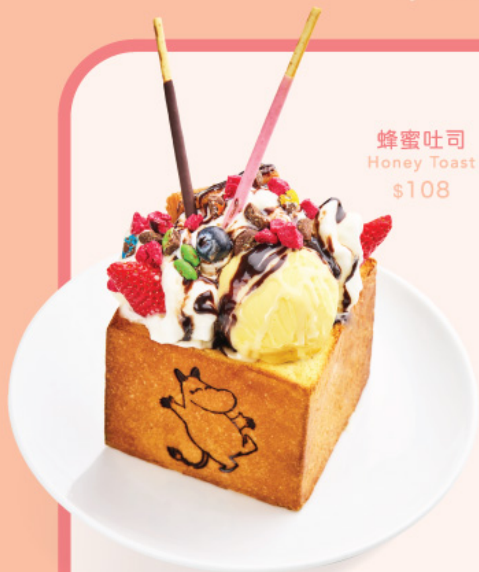
蜂蜜吐司 Honey Toast $108