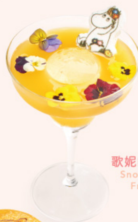
歌妮的水果梳打 Snorkmaiden's Fruit Soda $68