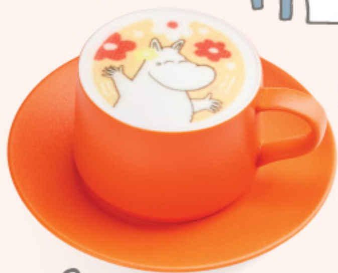
姆明的海鹽焦糖咖啡 Moomin's Salted Caramel Latte $68